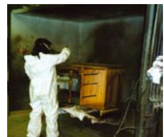
Figure 7 Walk-in booth