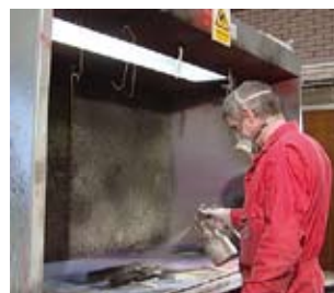
Figure 6 Small booth