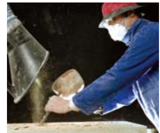
Figure 4 Fixed capturing hood